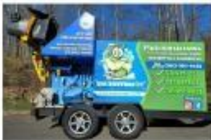
TRASH BIN CLEANING